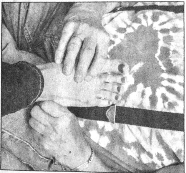
OUT & ABOUT

"It's about camaraderie and connecting with people," the practitioner said. Appointments can be made by calling or texting him at (207) 684-4294 or via Handprints Reflexology's Facebook page.